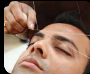
Eyebrow shaping and grooming